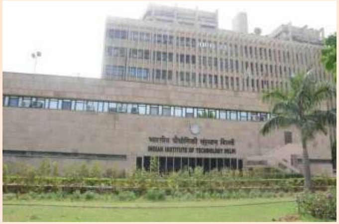
A view of Indian Institute of Technology Delhi (IIT).

February 16, 2019 <a href="https://www.thehindu.com/education/colleges/iit-delhi-looking-to-hire-100-foreign-teachers/article26291840.ece">https://www.thehindu.com/education/colleges/iit-delhi-looking-to-hire-100-foreign-teachers/article26291840.ece</a>