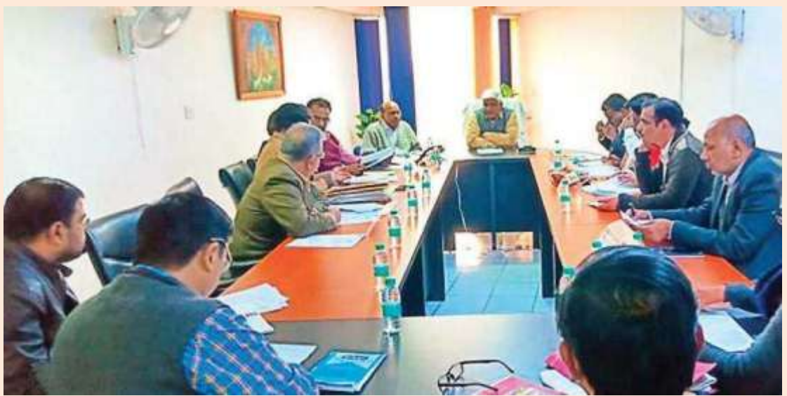
Delhi Minister for Social Welfare, Rajendra Pal Gautam, in a meeting with representatives of technological

In an attempt to eradicate manual scavenging in the city, the Delhi government is seeking robotic solutions to clean sewers and septic tanks.