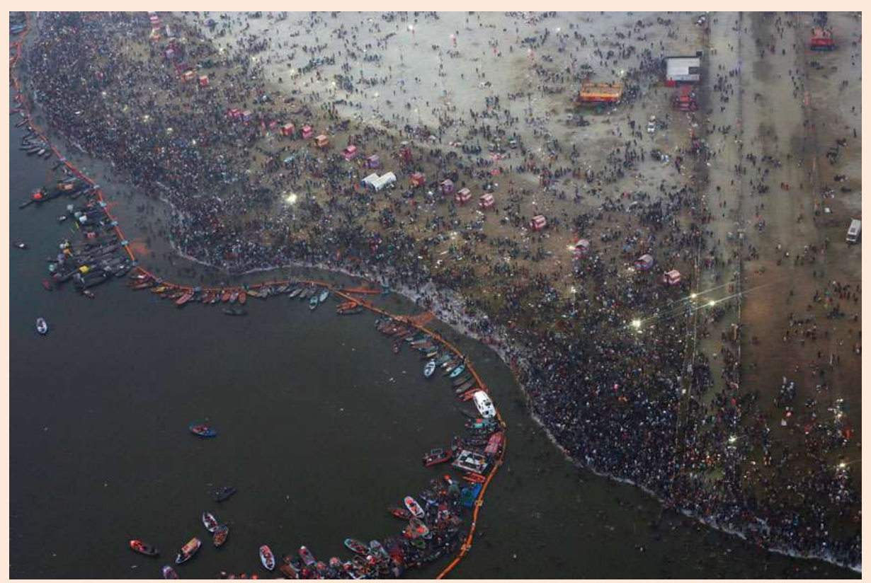
An aerial view of the devotees gathered to take a holy dip during the second Shahi Snan at Kumbh Mela in Prayagraj.

Scientists at IIT Madras have developed an algorithm that can help manage dense crowds using minimal manpower, and prevent deadly stampedes in huge public gatherings like the Kumbh Mela and the Hajj.